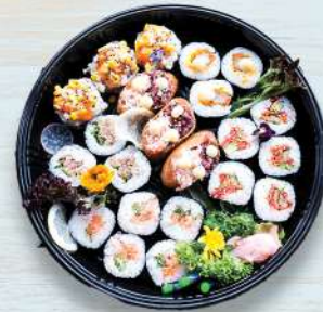
MIXED SUSHI PLATTER GF AVAILABLE

Choices of Crispy chicken, Vegan, Salmon, & Tuna