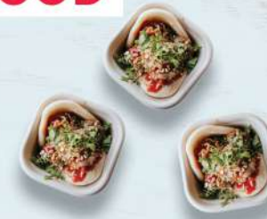
BAO BUNS Fried chicken, Vegan

Pork & chive, Red wine & beef, Chicken, corn & coriander Vegan tofu & edamame Prawn, pork & mushroom, Pork, ginger & coriander