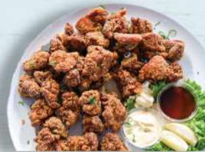
FRIED KARAAGE CHICKEN Sweet & Spicy, Kewpie Mayo