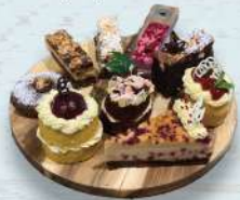
SWEET SLICES GF + VEGAN AVAILABLE

Pork & chive, Red wine & beef, Chicken, corn & coriander Vegan tofu & edamame Prawn, pork & mushroom, Pork, ginger & coriander