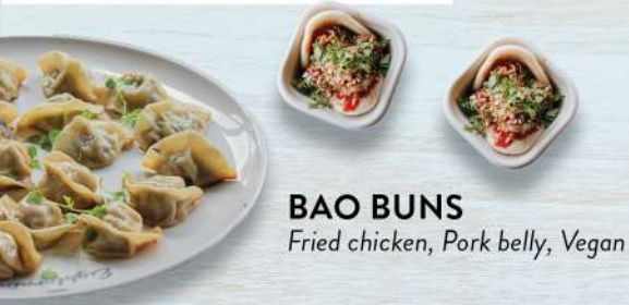
BAO BUNS Fried chicken, Pork belly, Vegan